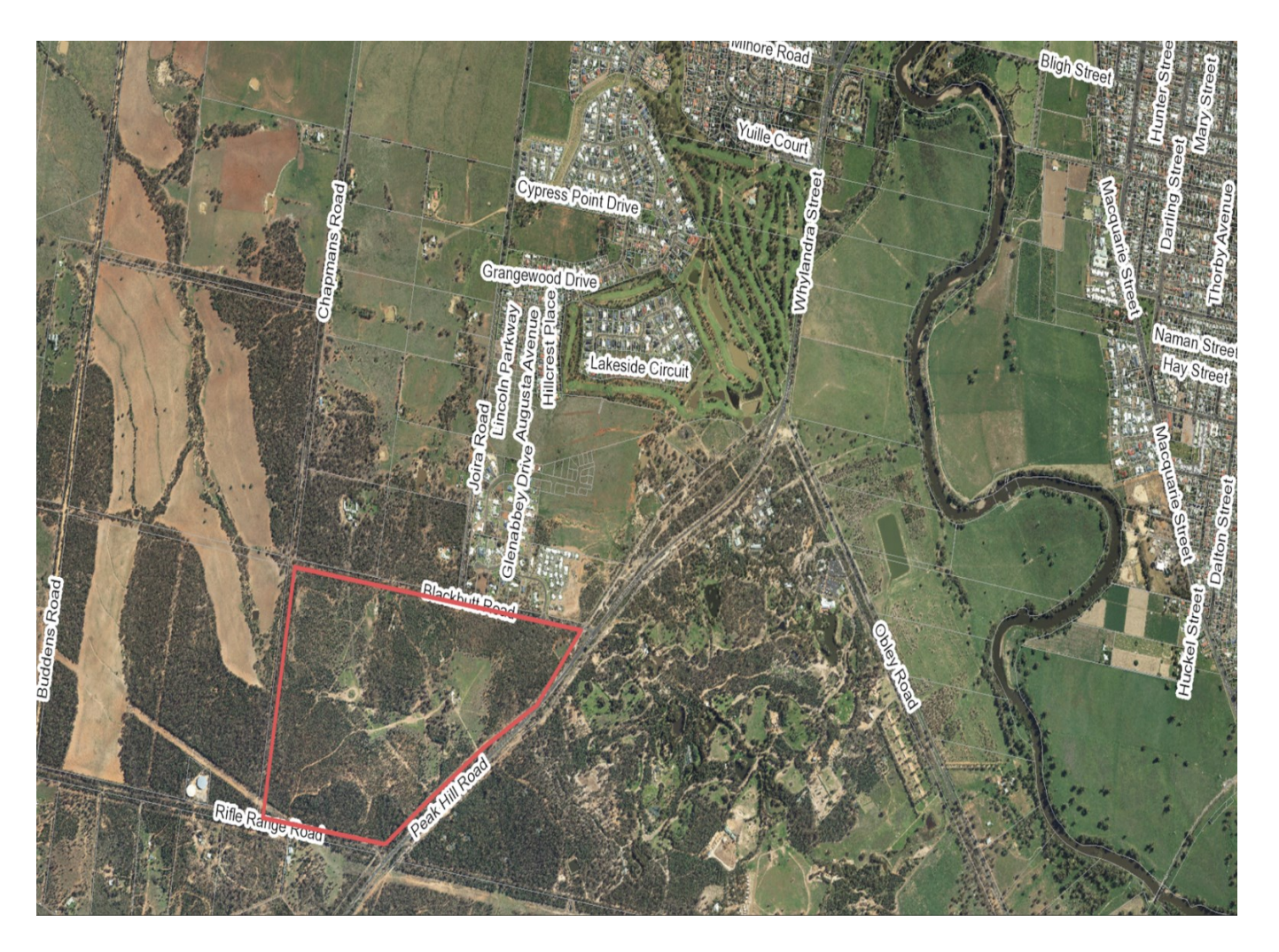
Figure 3. Lot 172 DP 753233, 20R Peak Hill Road, Dubbo

The allotment is located in south-west Dubbo and is boarded by Blackbutt Road to the north, Rifle Range Road to the south, Chapmans Road to the west and Peak Hill Road (Newell Highway) to the east. The site has an area of 98.14 hectares as shown in Figure 3 .