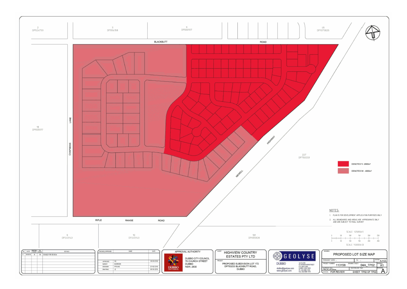
Figure 2. Minimum Lot Size changes and indicative subdivision plan

The intent of the Planning Proposal is to reduce the minimum allotment size for subdivision on the site from 10 ha to a range between 2,000 m² and 8,700 m² so as to allow subdivision of the land into smaller residential allotments. The Planning Proposal also seeks to amend the 'Natural resource—biodiversity' map to facilitate the future road and subdivision layout by reducing the area mapped as 'moderate biodiversity sensitivity' to selected areas which will be retained as bushland for public recreation and drainage corridors in the future residential subdivision.